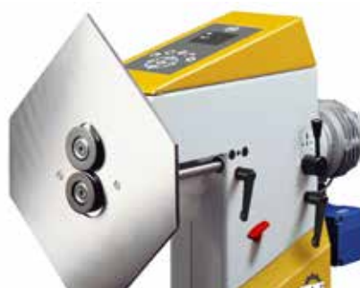
Stop plate for insulation pipes